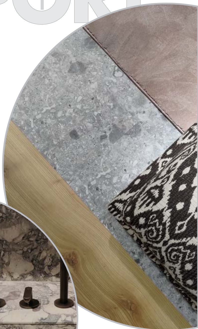
Light oak Monochrome textile White marble Dusty plum