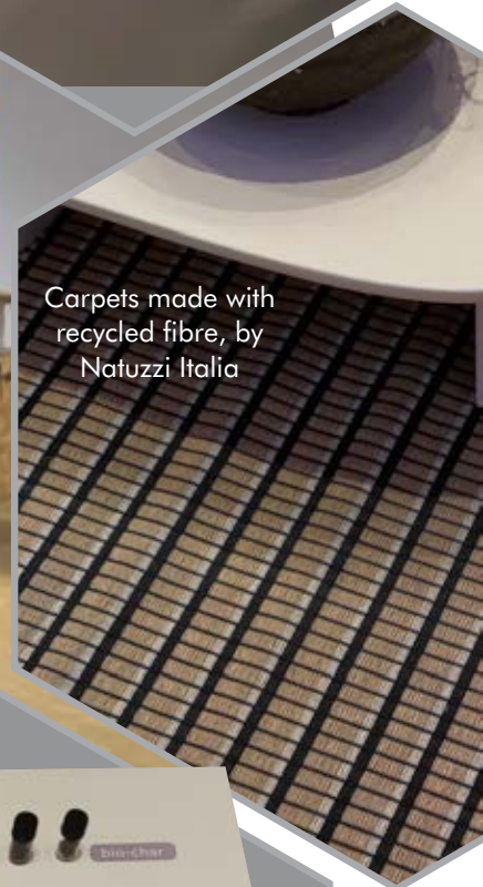
Carpets made with recycled fibre, by Natuzzi Italia