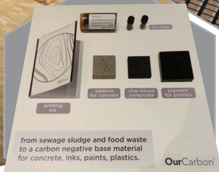
New solutions from a range of materials