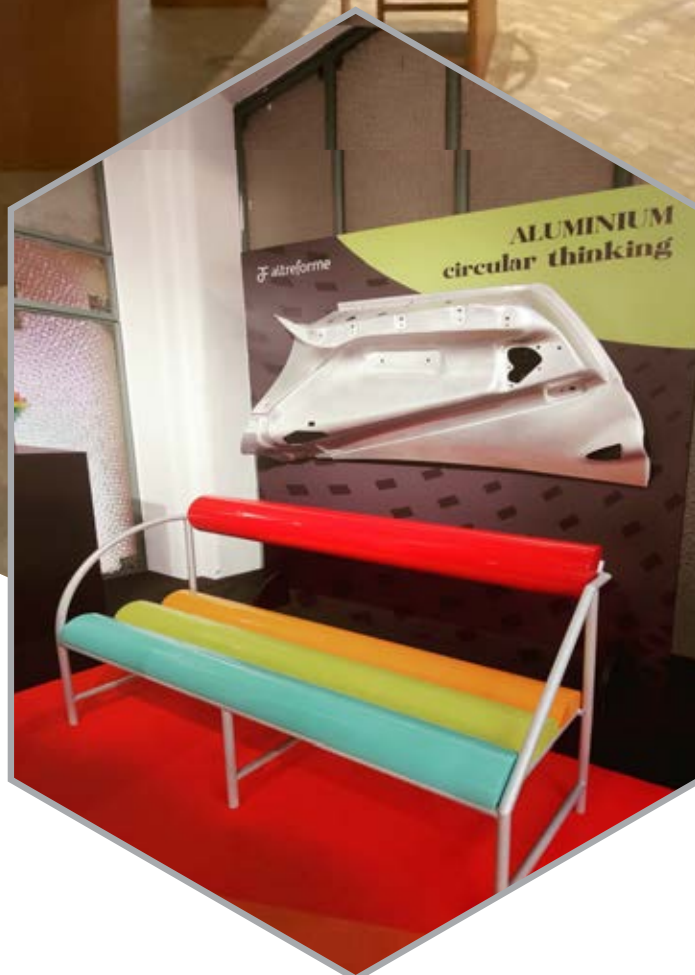
Precious metal components from cars reused